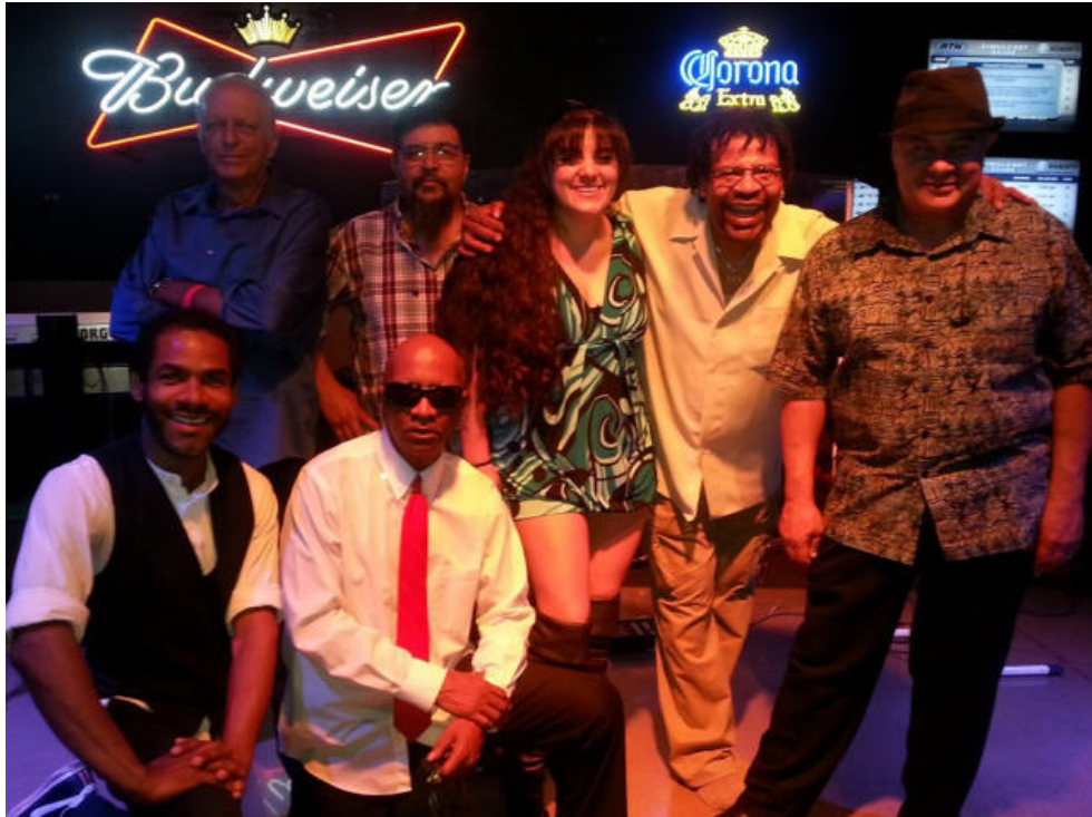
Fat City will be part of the Cotton Club Gala on Feb. 13.