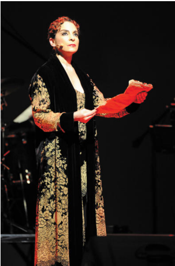
Actress Jasmine Guy stars in the production of “Raisin’ Cane: A Harlem Renaissance Odyssey” at Popejoy Hall on Feb. 26.

One of the highlighted events will be the “Cotton Club Gala: Funkalicious” on Feb. 13.